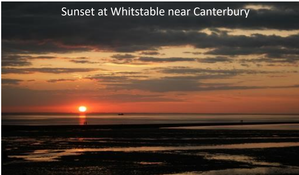
Sunset at Whitstable near Canterbury

Of course, there are also lots of different shops in Canterbury which is only a 15 minute walk away!